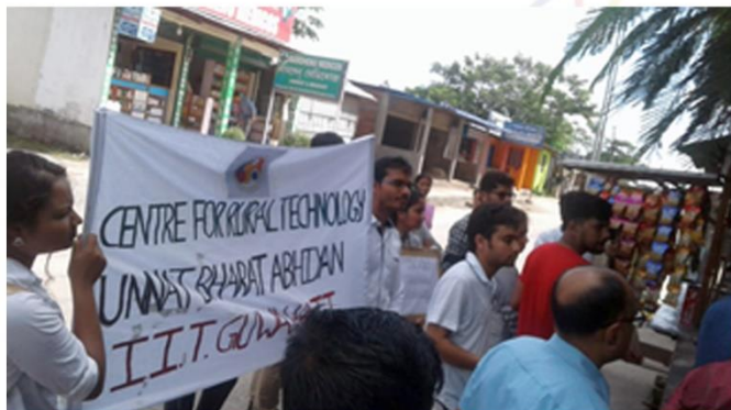
Distribution of bags made of used clothes to nearby market and village community and creating awareness about avoiding single use plastic