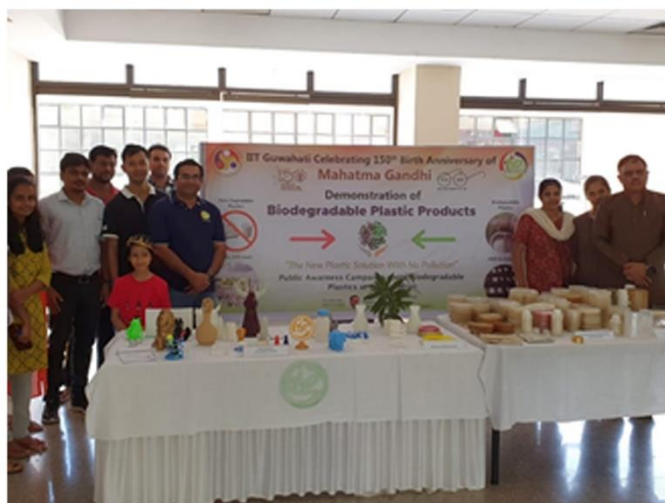
CoE-SusPol showcasing degradable bioplastics products developed for the eco-friendly society