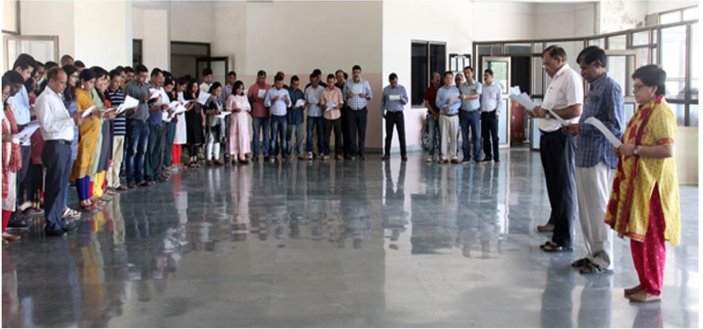
As part of Vigilance Awareness Week from 28 October to 2 November 2019, 'Integrity Pledge' was taken by the employees IIT Guwahati on 28 October 2019 at the foyer of the Administrative Building.