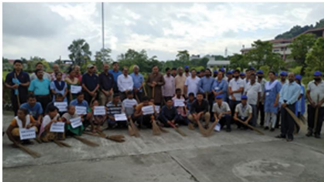
Cleanliness drive led by the Director and other functionaries, faculty, student & staff of the institute

To commemorate 150th birth anniversary of the father of the nation, cleanliness drive and various other awareness programme were organised in and around the Institute. Led by Hon'ble Director and the Dy. Director, various functionaries and students actively took part in these events